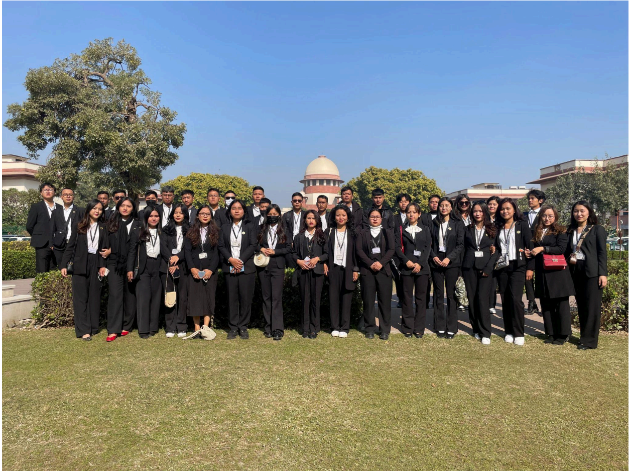
5th Semester Student at Supreme Court, New Delhi

The present report of the Study Tour organised by Govt. Mizoram Law College is a compilation of places visited and activities of educational trips to Delhi Supreme Court and other premises.