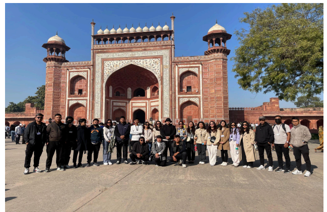
Taj Mahal Entry

The place was wonderful, and we saw a lot of tourist and visitors, we enjoyed the whole moment and to our surprised some female student were mistaken as Korean girls by the other visitors and even took some pictures with us and even speak with us in Korean but after we told them that we are also Indian citizen just like them we burst out to laughter which made the whole moment more precious and memorable.