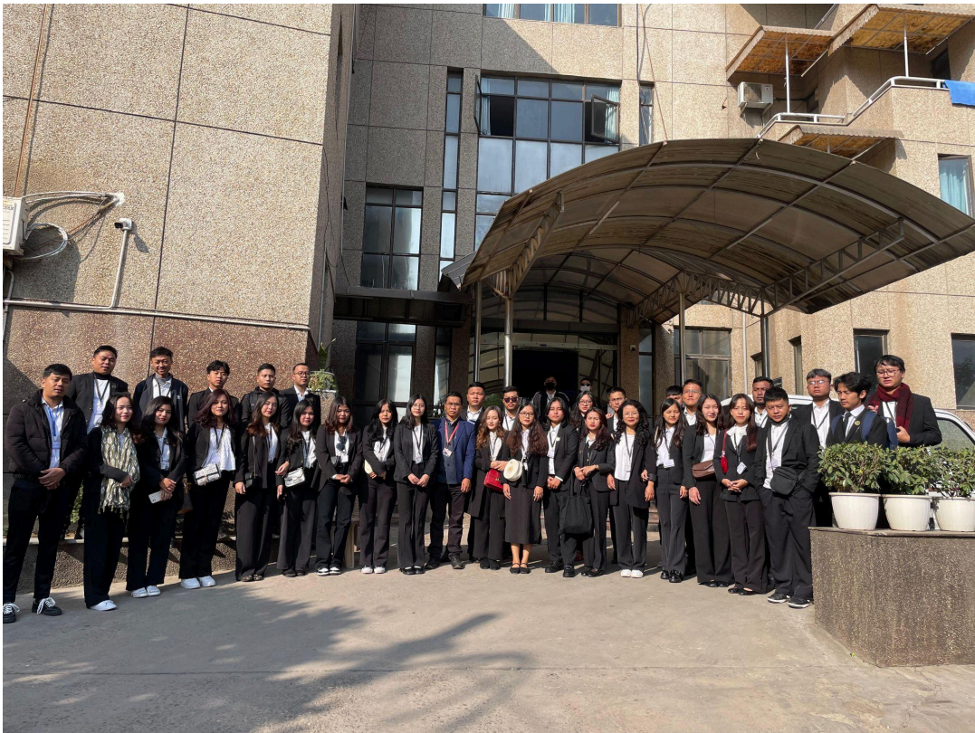
Mizoram House, Vasant Vihar

Furthermore, the study tour served as a crucible for personal and professional growth, nurturing skills in teamwork, time management, crisis resolution, and adaptability. As we navigated through the challenges and opportunities encountered along the way, we forged enduring bonds of friendship and camaraderie, creating memories that will last a lifetime. Thank You!