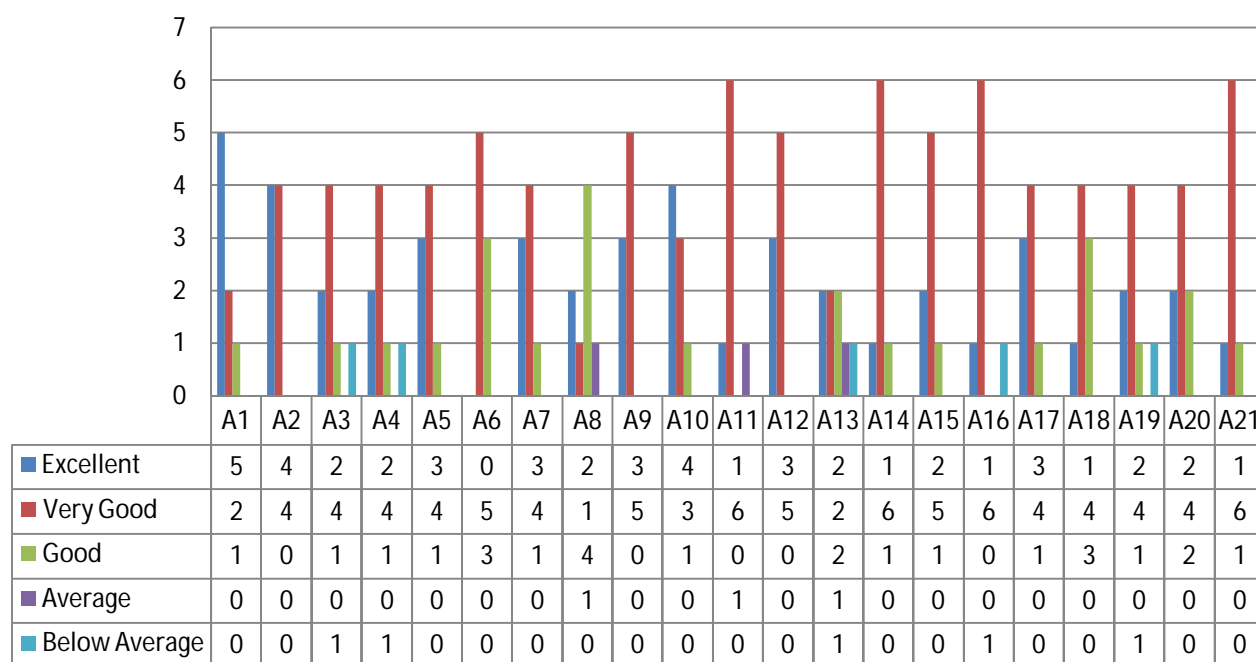
NUMBER OF RESPONDENTS WITH RESPECT TO DIFFERENT RATINGS

Data Interpretation: From the above data, it shows that 52.5% from the total 8 respondents have a Very Good opinion on the Various Criteria laid down as a feedback tool.